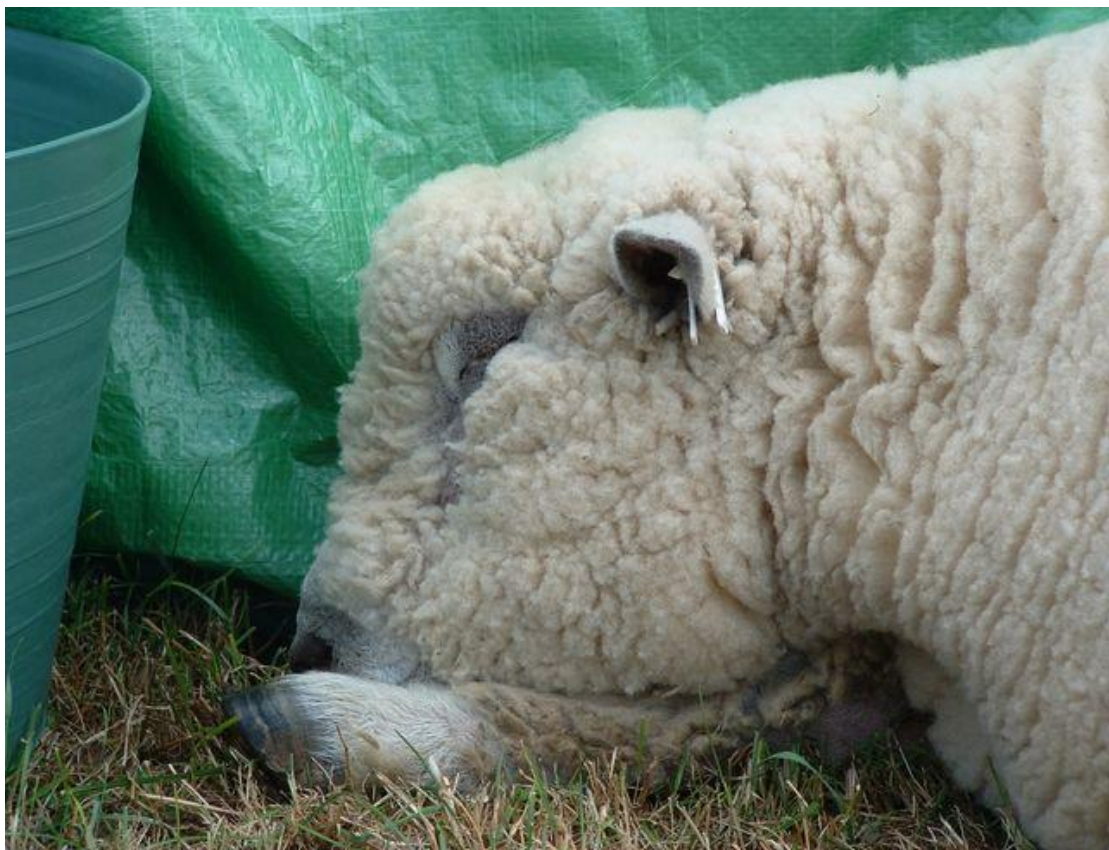
A well deserved nap after judging at Carmarthen County Show.

Once judging is over remember to make the sheep comfortable and provide some well earned food before you go off for a look around the show.